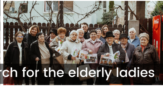
a special 8th of March for the elderly ladies