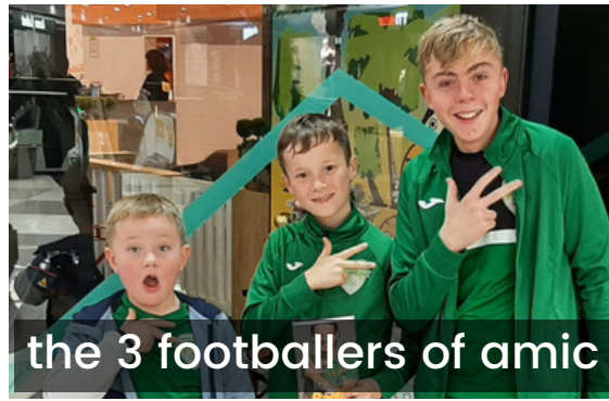
the 3 footballers of amic people of Ica Home