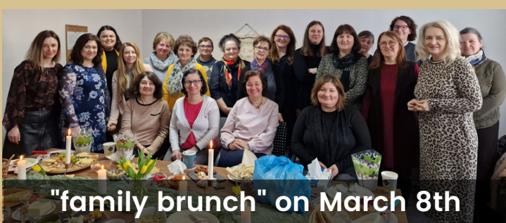
"family brunch" on March 8th