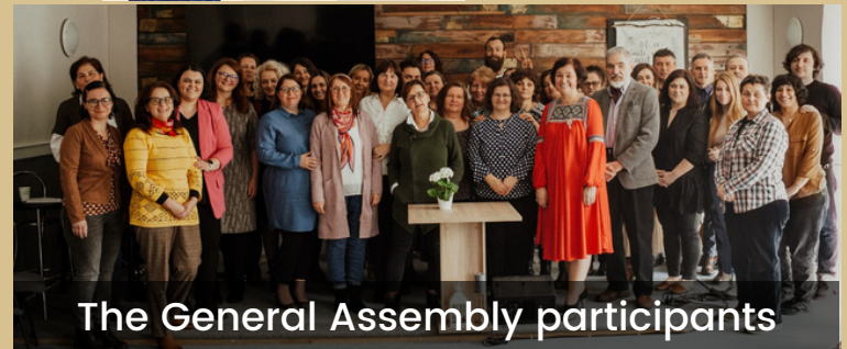
The General Assembly participants